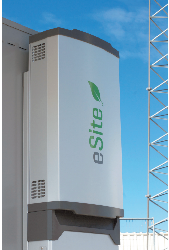
eSite x10 unit mounted onto an outdoor cabinet

And eSite x10 has been designed to withstand the most challenging outdoor telecom site environments, including temperatures of up to 50°C.