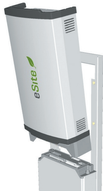
Main eSite x10 compartment simply slots in to its connection compartment